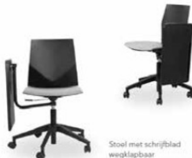
Stoel met schrijfbled wegklapbaar